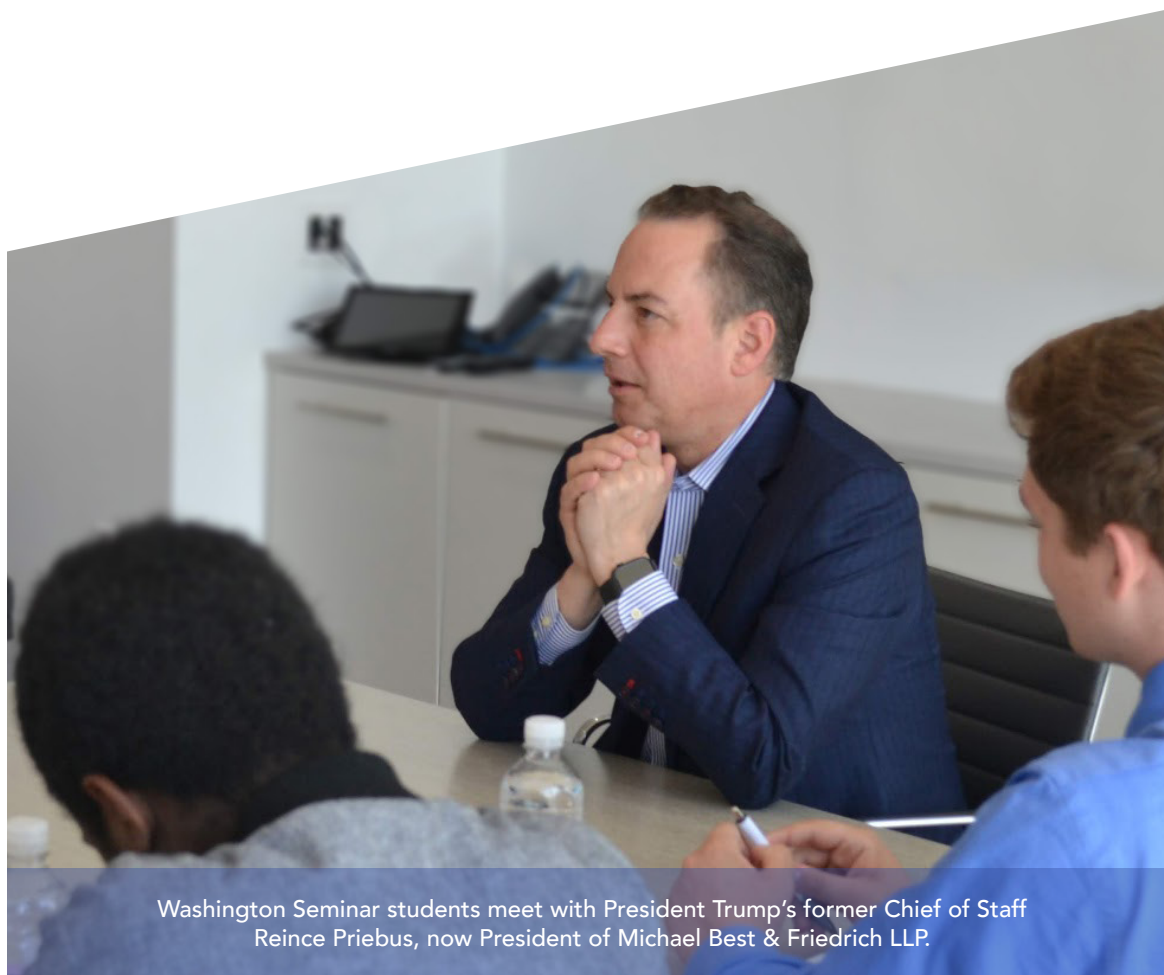
Washington Seminar students meet with President Trump's former Chief of Staff Reince Priebus, now President of Michael Best & Friedrich LLP.

"Our democracy depends on engaged citizens and this exceptional program creates an opportunity for students to learn about how public service and government can make a difference."